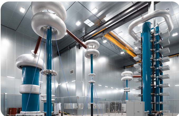
700m 2 Faraday cage for ultra high voltage (UHV) tests.